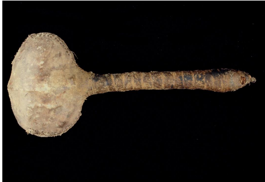
Hammer.