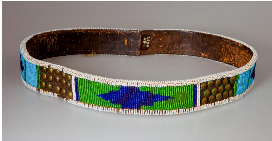
Beaded belt.