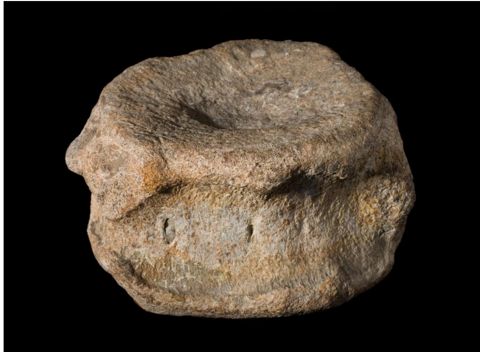
Candleholder.