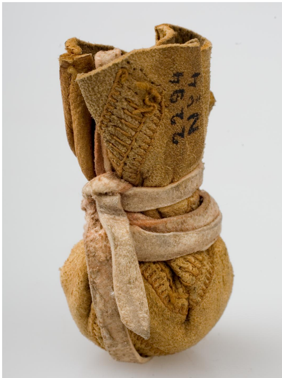
Paint bag. Courtesy National Museum of Ethnology, Leiden (2294-4)