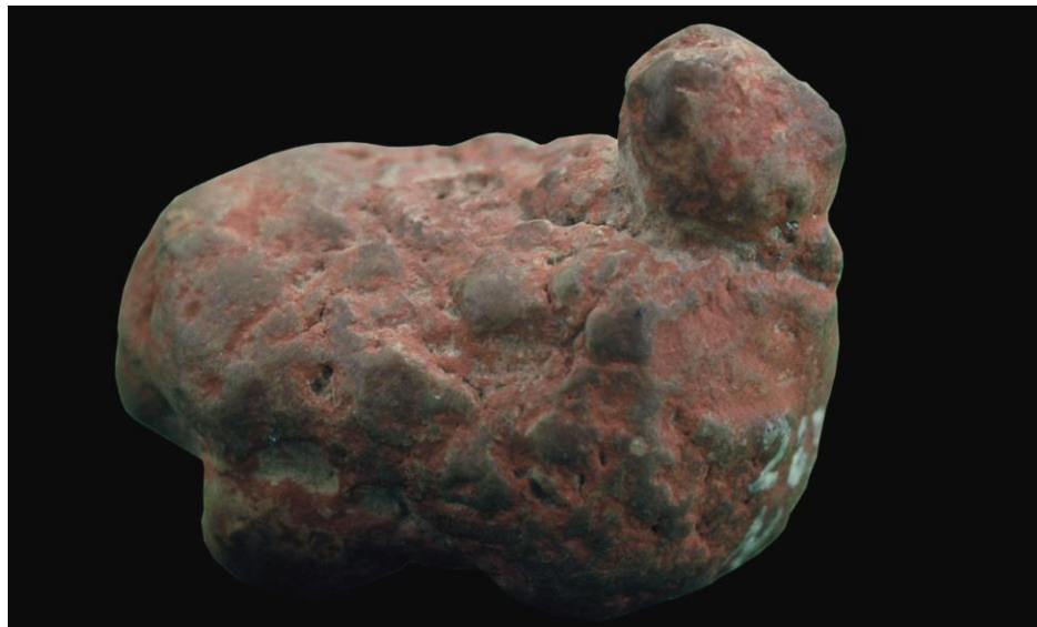
Buffalo stone. Courtesy National Museum of Ethnology, Leiden (2294-5)

Oddly shaped stones, including fossils of ammonites, were often picked up by Indians, and when they inspired positive thoughts and emotions were regarded as inhabited by supernatural powers. In such cases these stones were treated as spiritual objects. They were painted, fed, and kept reverently in a bundle or bag. Their powers were addressed by prayer