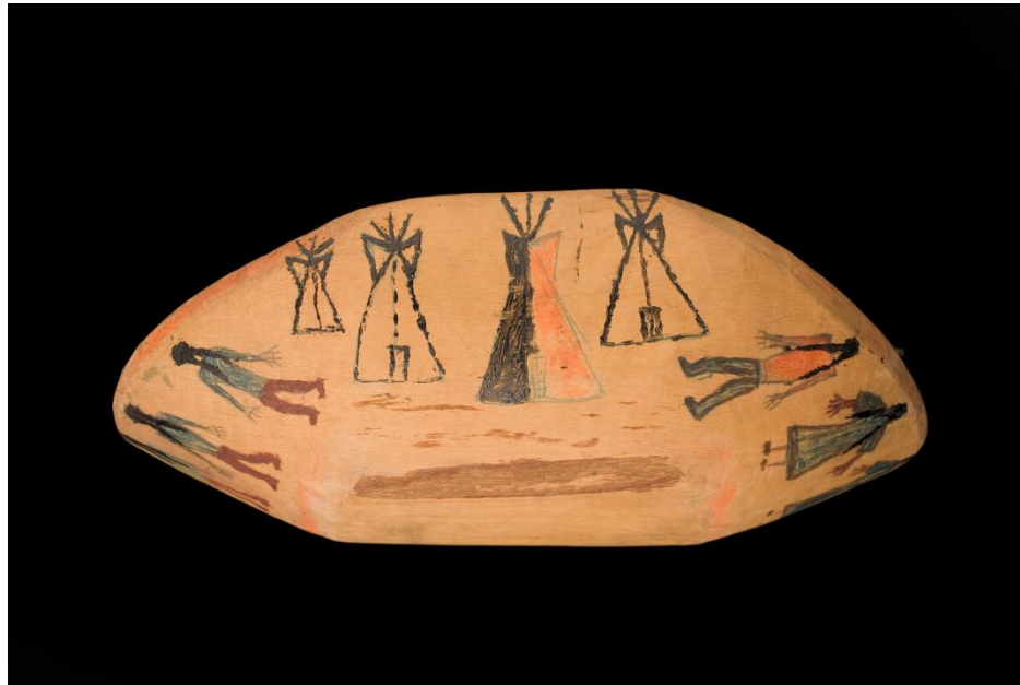
Wooden bowl.