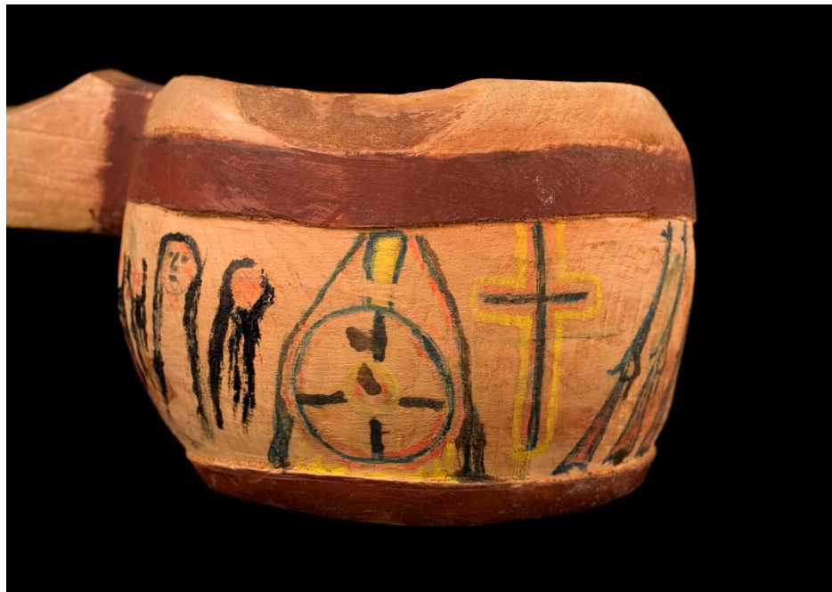
Wooden dipper or bowl. Courtesy National Museum of Ethnology, Leiden (2294-1)

The painted designs on bowl 2294-1 include seven human figures, five guns, a cross, a shield, six scalps or human heads with long hair. The designs are applied with black oil paint, black ink, and red, blue, and yellow crayon. The outer sides of bowl 2294-2 exhibit painted designs of 21 tipis. On both sides of where the handle is connected to the bowl, a design possibly indicating a shield with scalps hanging from it is painted. The tipis around the sides probably represent a camp circle. The scenes painted on the flaring sides of bowl 2294-3 depict an encampment consisting of three tipis, a number of Indian men and women in a row, and what appears to be a battle scene, involving two mounted warriors and two white people.