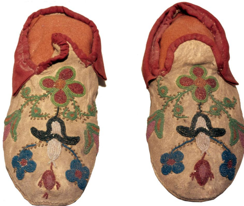
Beaded moccasins. Courtesy National Museum of Ethnology, Leiden (2294-12)

tribe formerly made moccasins in the pattern requiring the U-shaped insert, but in the course of time adopted different patterns, including the hard-soled variety, in which this element had no structural function, but retaining it as a valued decorative element. One Blackfoot informant interpreted the U-shape, with or without outward radiating lines, as representation of the aurora, but Wissler points out that he regards this as an individual rather than generally shared view (1916:105-107, 113). Moreover, Ewers (1945:54) emphasized that Blackfoot names for their beaded designs are descriptive rather than symbolic.