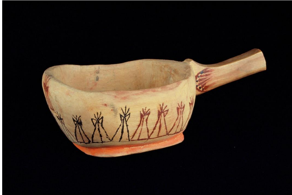
Wooden bowl. Courtesy National Museum of Ethnology, Leiden (2294-2)

The Blackfeet were frequently at war with their neighbours: Flatheads and Crows to the south, Assiniboines, Crees, and Sioux to the west. Indian men painted pictographic records of their war exploits on skin robes and lodge linings, later on canvas and muslin supplied by Indian traders. Blackfoot pictography is simple in style, more informative than aesthetically pleasing, as John C. Ewers has pointedly remarked. The narrative structure usually remains oblique, as the figures are often spread across the surface without apparent narrative design, resulting in “pictorial shorthand”. However, singular motifs, as well as groups of single designs, readily convey messages that were understood by tribal members, as well as nearby tribes. Severed heads, horses, and weapons usually stood for scalps, animals and arms taken from enemies. Some such paintings contain pictographic signatures of their maker (Ewers 1945:20-24; 1983; Walton 1985:222-230). The Blackfeet refer to pictographs and writing by the same term: sinàksin , meaning ‘made marks’ (Uhlenbeck 1930:66,255).