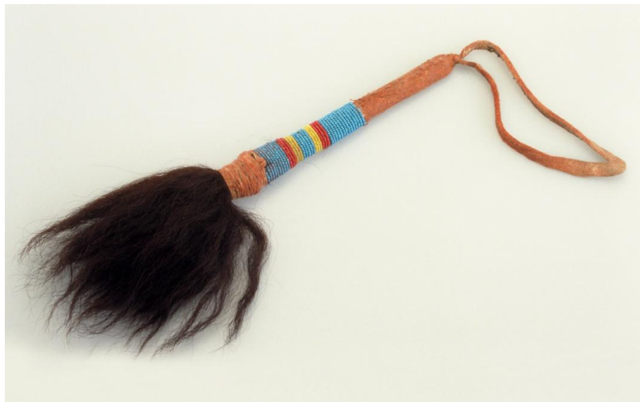
Asperger. (2294-6)

Aspergers were used in Native North America in a variety of ceremonies. This specimen was part of the Plains sweat lodge ritual ( tsískani , tsiskáni , or ixtsískàni ). This took place in a dome-shaped circular hut, covered with buffalo hides, evocative of the shape of the sun and overarching sky, and was regarded as a sacred space. Stones, the oldest living beings on earth according to Blackfoot traditions, were heated, taken inside and wetted with the asperger, creating clouds of steam. Thus the participants purified themselves physically as well as spiritually, communicating with the supernatural protective powers through the rising steam. This was often done in preparation for other ceremonies. Depending on the latter, the sweat lodge ritual was adapted to appropriate religious requirements (Ewers 1955:223-224; Harrod 1987:128-131; Sriver 1990:197; Dempsey 2001:613). The Leiden asperger is made from buffalo hair, attached to a wooden stick, wrapped in hide, and beaded in red, yellow, and blue. Often horsehair was used in the manufacture of this type of ceremonial paraphernalia