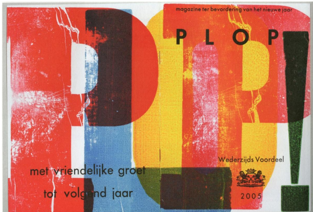
Plate 3. Plop. Pers No 14 , 2005.

the development of the profession book designer. Organizations like the Stichting De Roos ('The Rose Society') revived bibliophile books for the love of typography and quality book production.