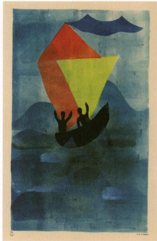
Plate 2. Martin Buber. Chassidische legendes . Illustration for the Journey to Jerusalem. De Blauwe Schuit , 1942-43.

pedestrian typography of some Blauwe Schuit publications. Werkman's books express energy and enthusiasm – the antithesis of Van Krimpen's classicism – and pushed experimentation in Dutch private press book design well into the 20 th century. Of 40 books produced by De Blauwe Schuit , Chassidische Legendes ('Hassidic Legends') is perhaps the most outstanding: a profoundly moving testament to the power of the private press, working under duress. Werkman was executed by the Nazis just days before the liberation of Holland.